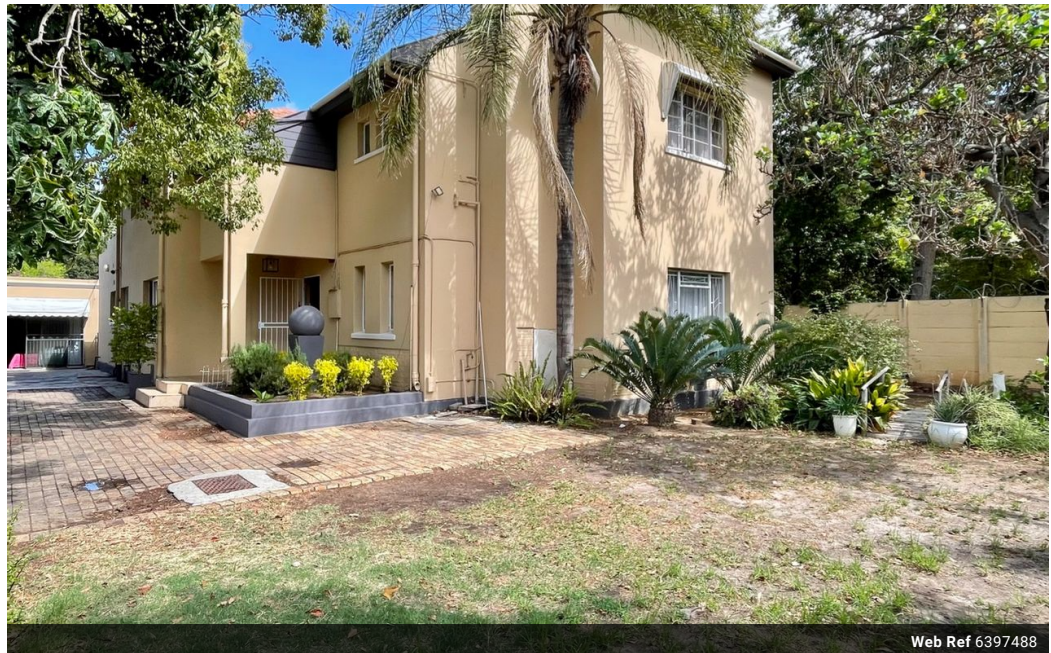
Web Ref 6397488